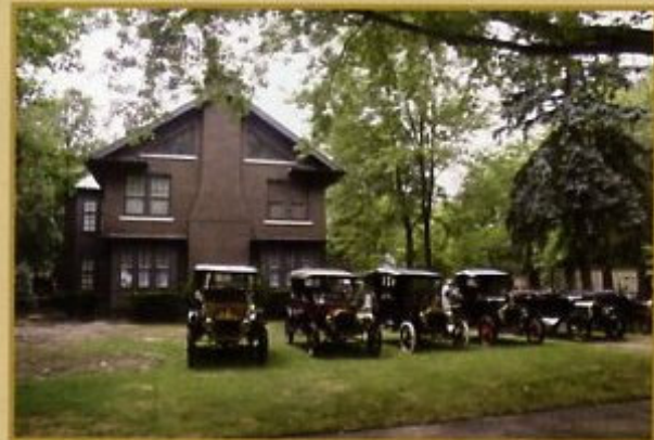
Edsel & Eleanor Ford "Honeymoon" house - Iroquis Indian Village. They moved here when they married on 11/1/1916 in the J.L. Hudson home on Easy Boston Blvd. - (J.L. Hudson was Eleanor Clay Ford's uncle).