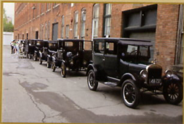
June 19, 2005, Model T's start to gather at the Piquette Avenue Plant prior to departure for the Detroit Yacht Club's Father's Day Antique Car and Boat Show. All Piquette T's tours depart from the old factory.