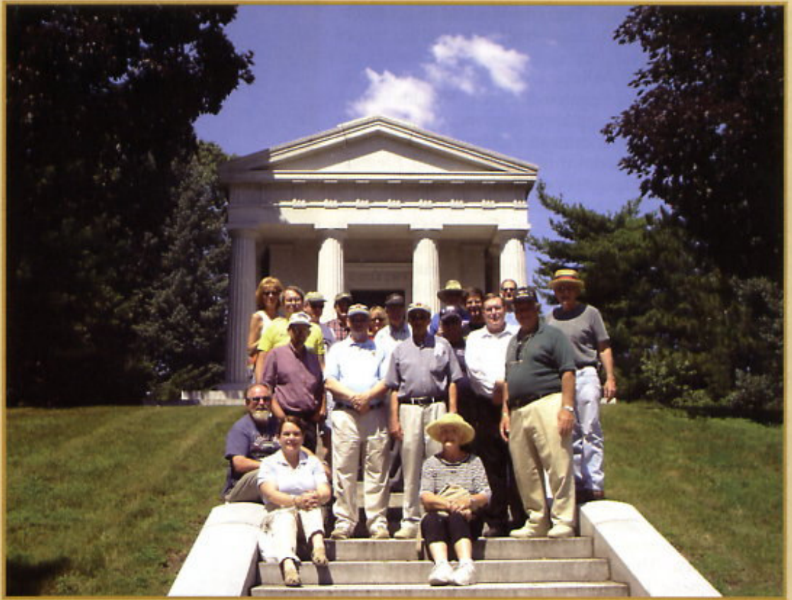
Piquette T members on the stairs of the James Couzen's mausoleum in the Woodlawn Cemetery on 7/9/2005. James Couzens was an original Ford stockholder and later Mayor of Detroit and a U.S. Senator. The structure was built at a cost of $150,000 following his death in 1936.